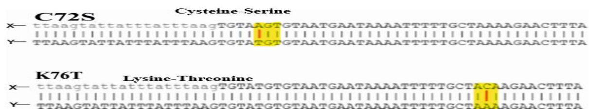
Fig. 3. BLASTn result comparing the Query Sequence (X) with the Reference sequence from the gene bank (Y)